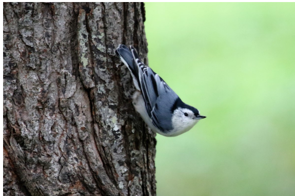
White Breasted Nuthatch

Directions: Take Exit 150B on I81 and follow signs to Route 220N. Go about 4 miles and take a left at the entrance to the Greenfield Education and Training Center, across from the entrance to Ashley Plantation. Park in the second lot on the right.